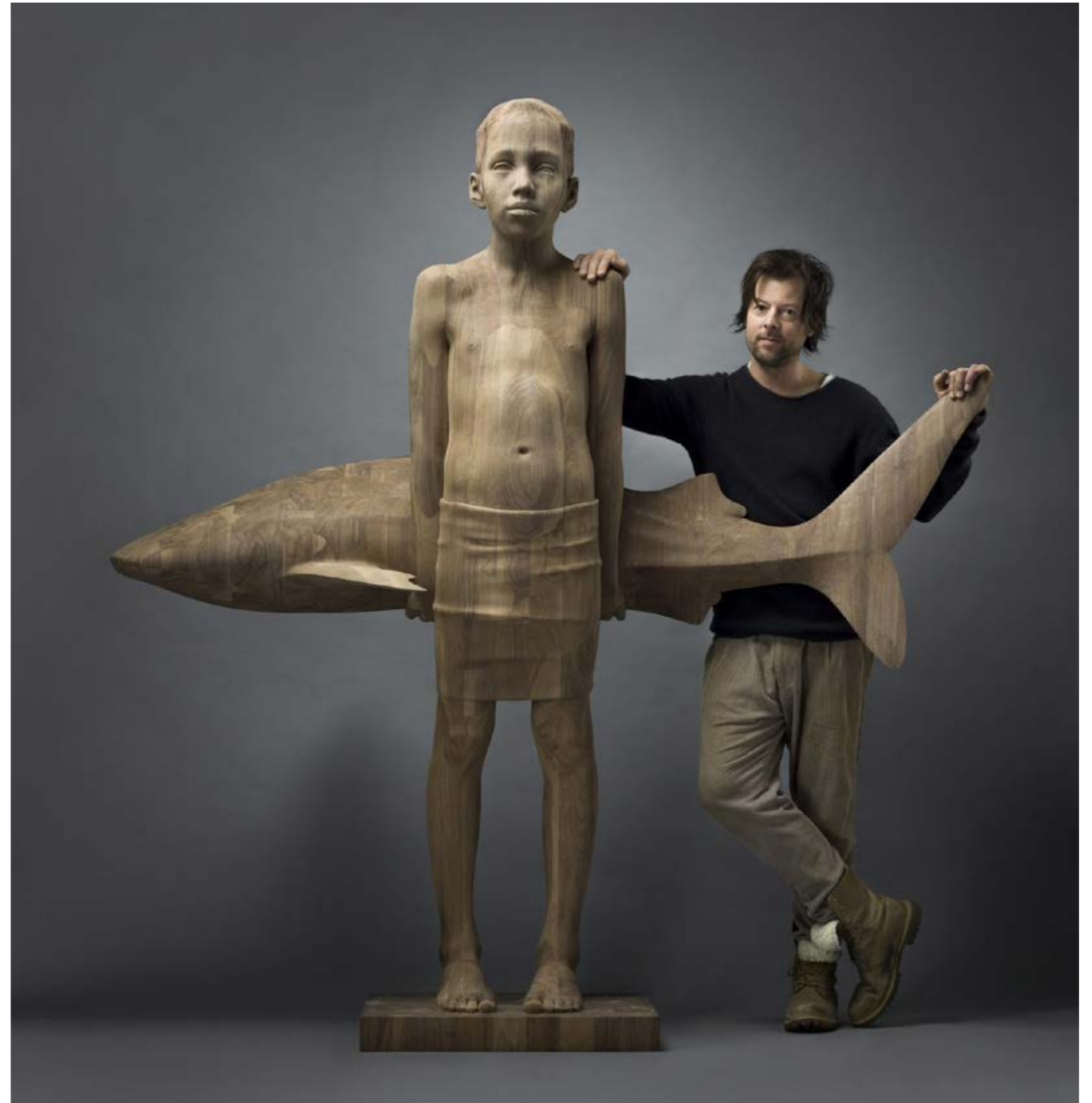
No. 195 Boy with Shark , walnut wood (right)