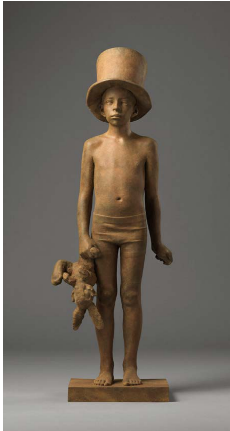
No. 199 The Magician , bronze (left)