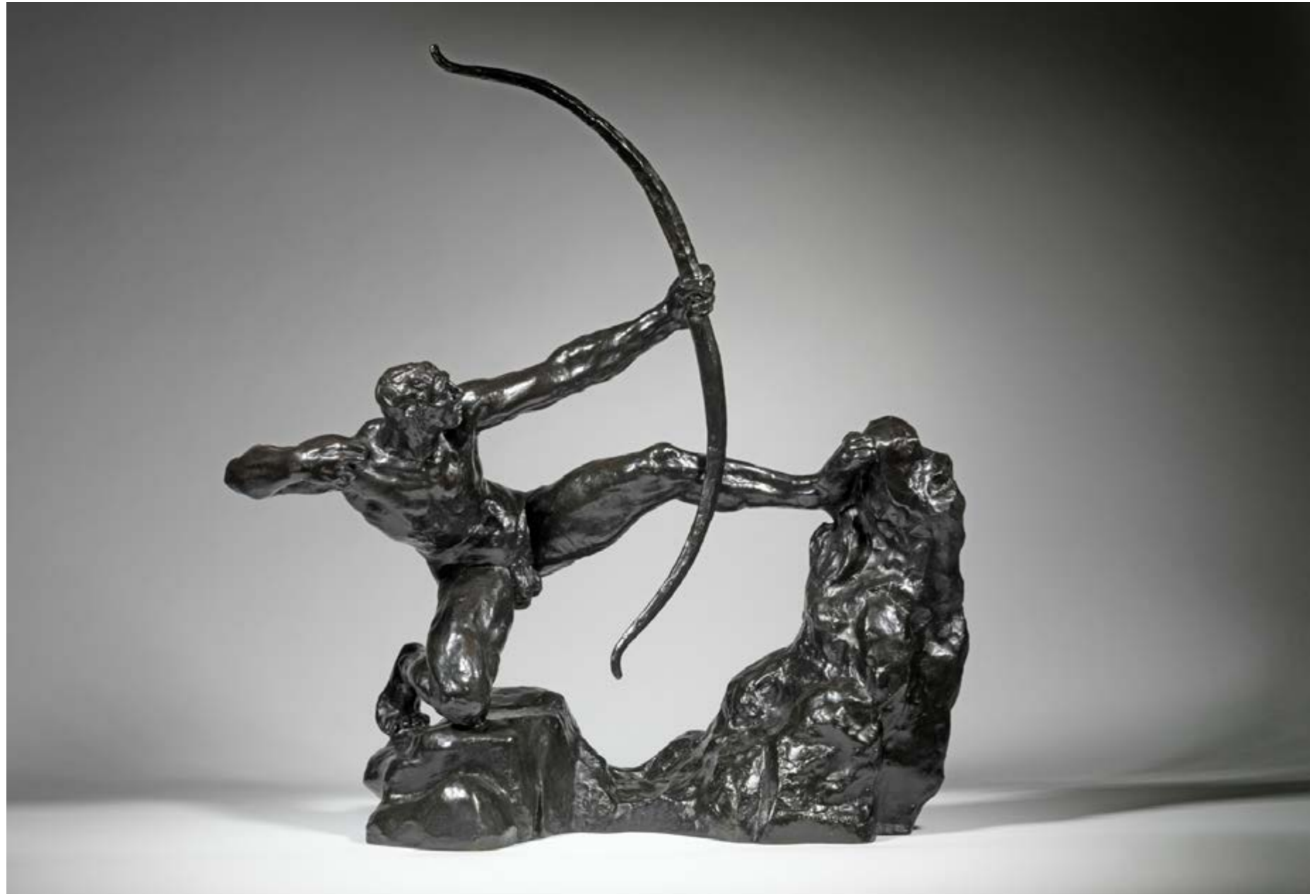
Herakles the Archer, Naturalistic Face, c. 1909 (left) Penelope Waiting, 1912 (right)

The essence of Bourdelle's work is romantic in subject and monumental in form, taking inspiration from both classical and medieval sources. He was keen to see sculpture return to its traditional outdoor and architectural settings, whilst retaining emotion and strength in the modelling. At the turn of the century, he worked as an assistant to Rodin, however he was an accomplished sculptor himself, with a developed and independent style. The rough surfaces of his works are perhaps influenced by Rodin; however, his use of flat, simplified forms looks to Romanesque art.