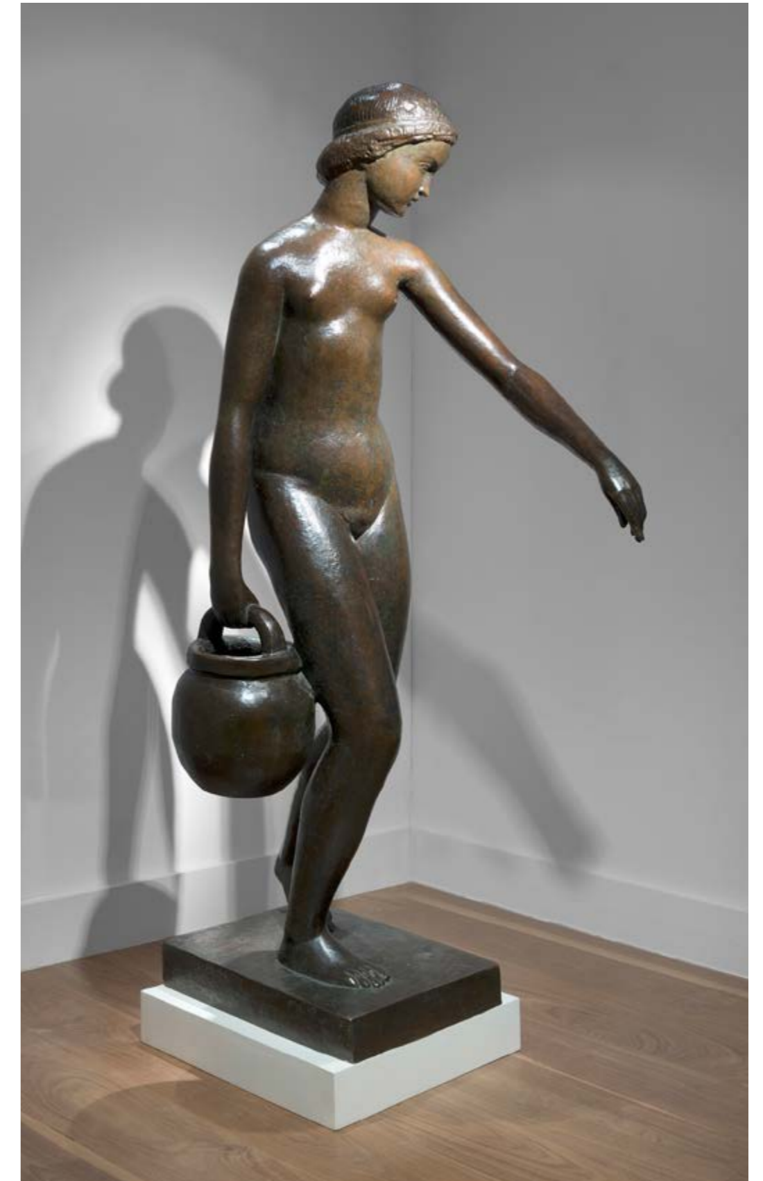
Les Deux Danseuses , c.1912 (left) The Water Carrier , 1910 (right)