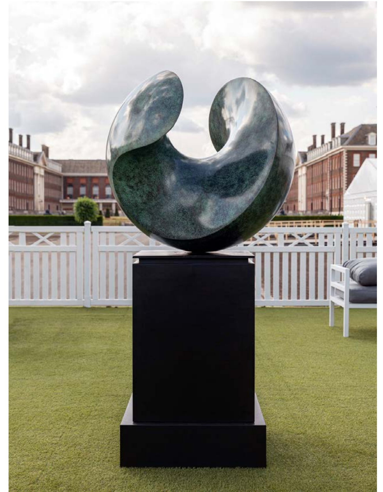
What's the Point, monumental (left) Sphelix 920 (right)